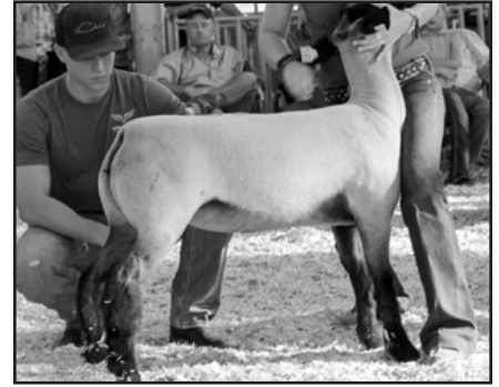
Champion Natural Colored Wether Dam, 1st Yearling Ewe from Hill Country Show Lambs sold to Indiana at $1,100.