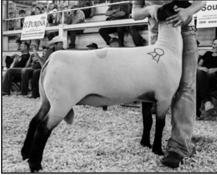
Champion Suffolk Wether Sire, 1st Yearling Ram from Slack Club Lambs sold to Pennsylvania at $3,100.