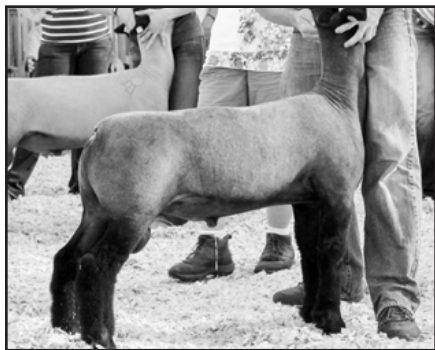
Champion Natural Colored Wether Sire, 1st March Ram Lamb from Harms Show Lambs sold to Ohio at $2,700.