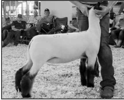
Res Champion Hampshire Wether Dam, Res Junior Champ, 1st March Ewe Lamb from Ellerbrock Club Lambs sold to California at $4,500.