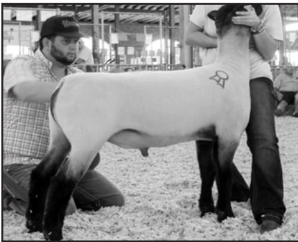
Reserve Champion Suffolk Wether Sire, 1st January Ram Lamb from Slack Club Lambs sold to Texas at $1,500.